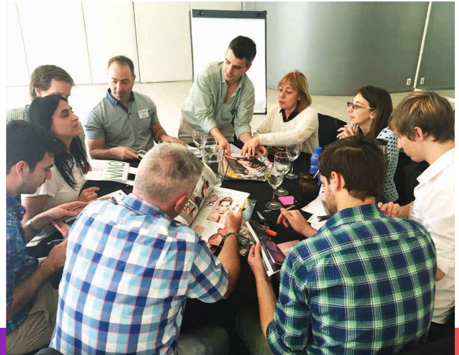
Our Argentina team in a workshop for The Godrej Way – the values that connect us as a business.

We selected a representative sample of each stakeholder group from each location. We then conducted engagements through various forums and discussion platforms.