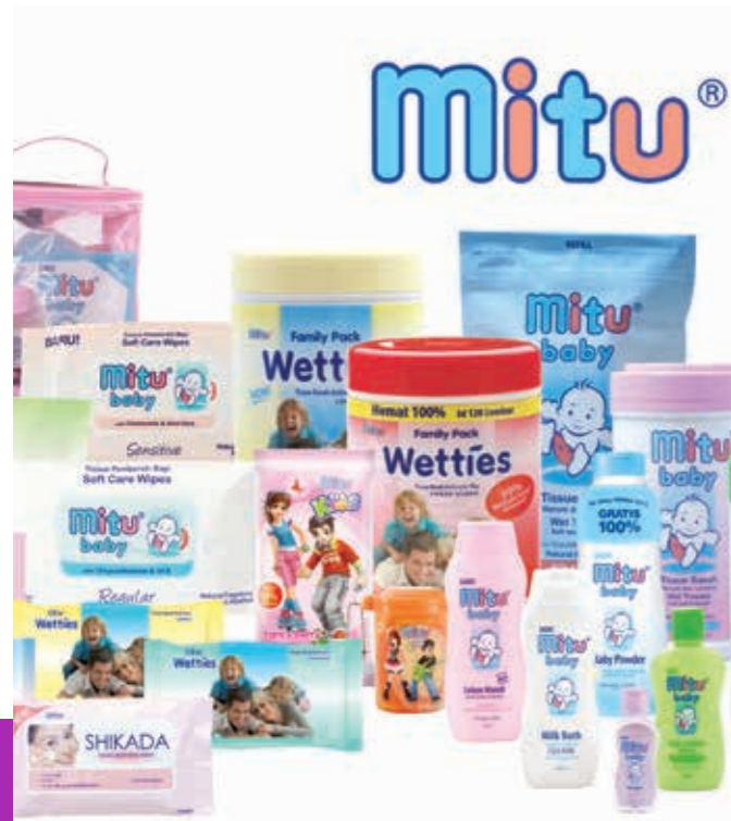
Product range customised to the region

We believe that on the other side of every risk is an opportunity waiting to be explored.